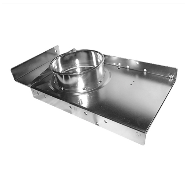
ADWR - Sliding damper manual rolled edge

Manual tight damper with rolled edge. With gaskets for a better air tightness. Identical construction as the automatic models, but without accessories. Galvanised steel or stainless steel AISI304. Thickness: 0,9 - 2,0 mm.