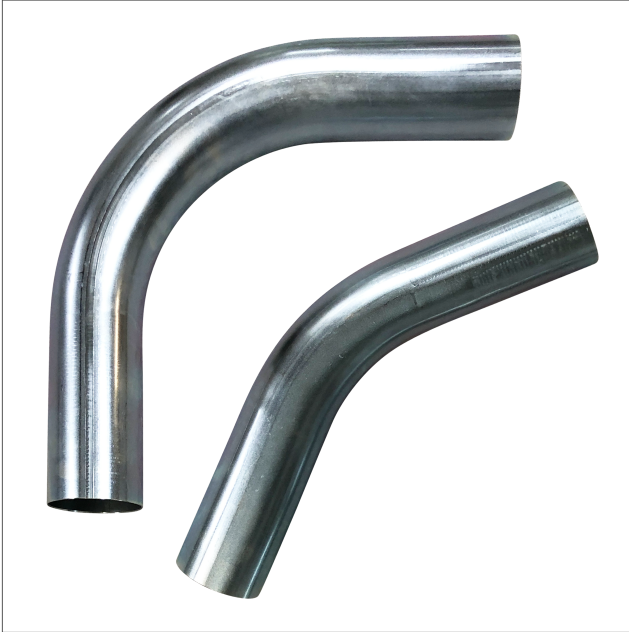
STBE - Steel bend galvanized

STBE steel bend in galvanized design, with straight edges and extended ends.