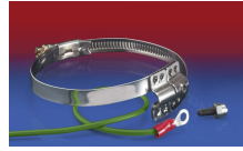
CLAMP 212 EC