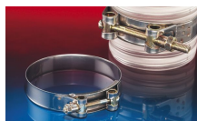
CONNECT KARDAN 254