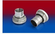
CONNECT STORZ DIN ALU 251