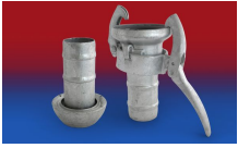
CONNECT KARDAN 254