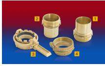
CONNECT TANK TRUCK CLAMP 211 BRASS 252