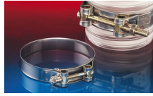
CONNECT TANK TRUCK CLAMP 211