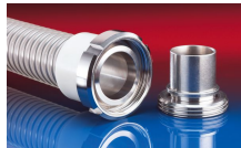
CONNECT MOULD ASSEMBLY 233