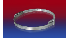
CLAMP 210 BRIDGE CLAMP