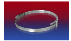
CLAMP 210 BRIDGE CLAMP