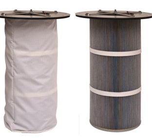
Conductive Aluminized Spun Bond Reverse Purge Cartridge (shown with and without optional skirt) - Included

HEPA Filter with Safety Filter - Included