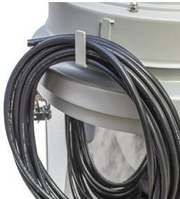
Cable Holder Hook included on the side of the powerhead