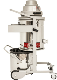
C-35L EX DT (MFS) with Recovery Tank removed