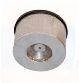
Upstream HEPA Filter - Included