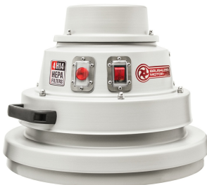
Longer Life Brushless Motor Available (always with 4 x H14 HEPA filters)