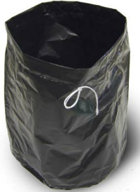
Conductive Polyliner Recovery Bag - Optional