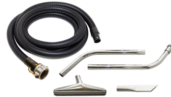
C-35 EX DT Tool Kit - included