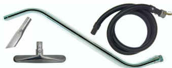
Ø1.5" (Ø38 mm) Static Dissipative Tools and Accessories - Included