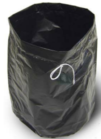
Conductive Polyliner Recovery Bag - Optional