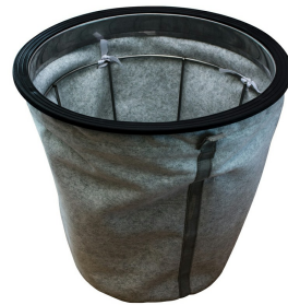
Main Cloth Filter and Cage, Static Dissipative - Included