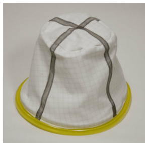
Main Cloth Filter, Static Dissipative - Included