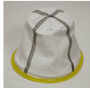
Main Cloth Filter, Static Dissipative - Included