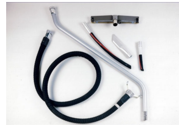
Tools and Accessories (Nitrile) - Included