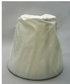
Pre-Filter, Static Dissipative - Included