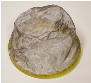
Liquid Filter - Included