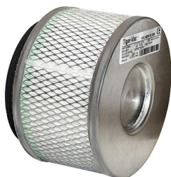
HEPA Filter - Included