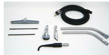
Ø1.5 (Ø38mm) Static Dissipative Tools and Accessories - Included