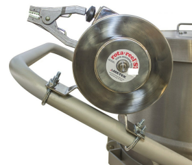
Grounding reel with stainless steel housing and cable - Optional