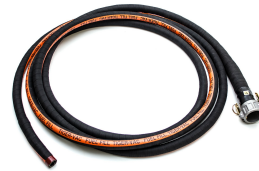
Nitrile Suction Hose - Included