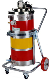
EXP1-25 (TC) TE