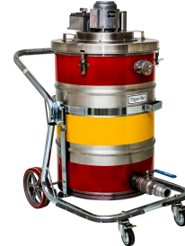
EXP1-55 (TC) TE