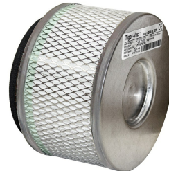
HEPA Filter - Included