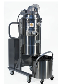
EXP1-35L (MRP) Extended with Detachable Tank removed