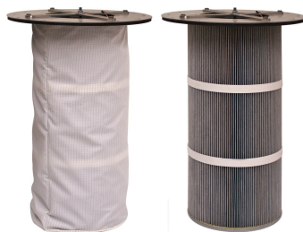
Conductive Aluminized Spun Bond Reverse Purge Cartridge (shown with and without optional skirt) - Included