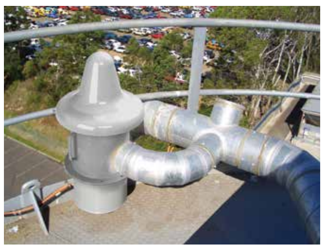
Silo workspace using VHS valve